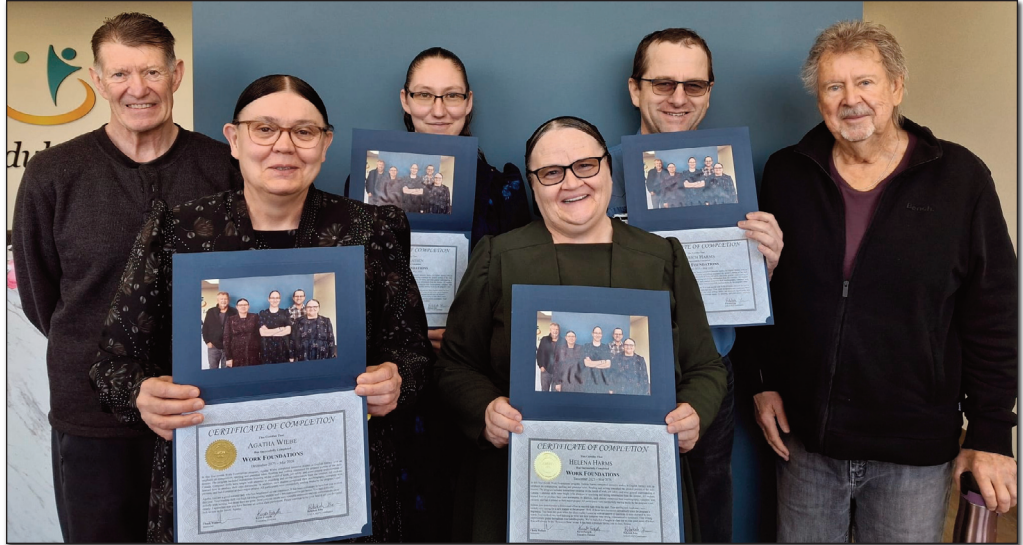
Work Foundations Class of 2026 celebrates the successful completion of classes!