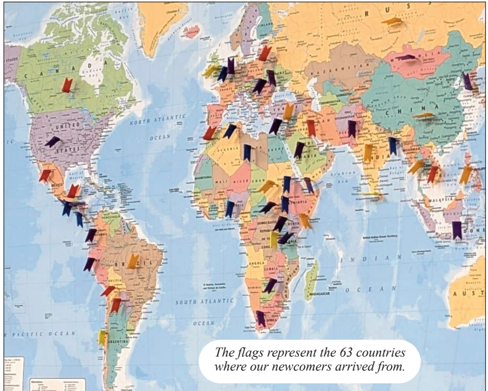
The flags represent the 63 countries where our newcomers arrived from.