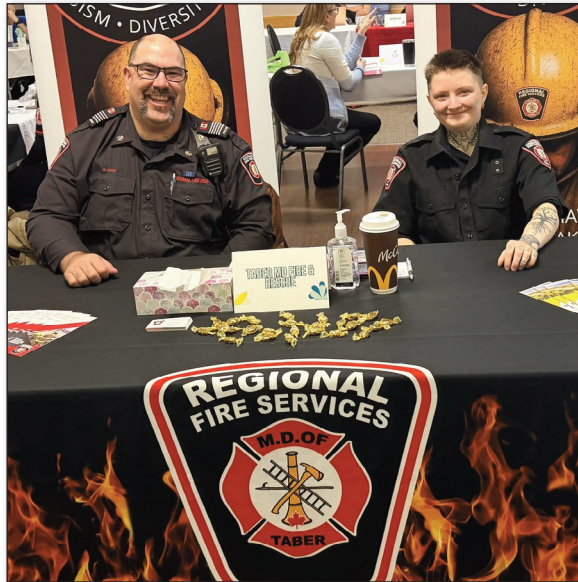
M.D. of Taber Regional Fire Services participated in the Spring Job Fair in March, hosted by Taber Adult Learning. The event was attended by 16 employers and over 60 job seekers.

The success of these fairs, however, is not found merely in the number of booths in the room, but in the intensive preparation TEA provides leading up to the events. We believe that a job fair is only as effective as the candidates attending it. In the weeks prior to each fair, TEA hosts specialized "Job Fair Readiness" workshops. We work one-on-one with job seekers to polish resumes, refine professional attire, and practice the "elevator pitches" that make a lasting impression on hiring managers. For the job seeker, we turn a daunting gymnasium full of employers into a room full of accessible opportunities.