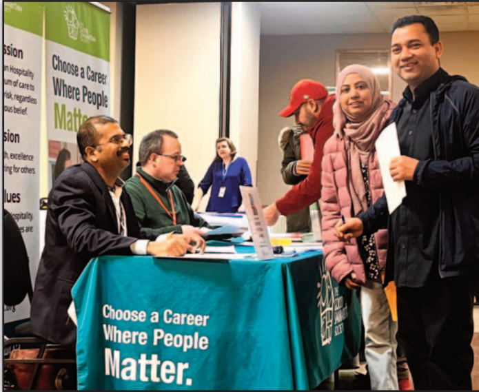
Taber Employment Assistance March Job Fair.