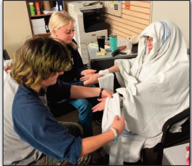
Youth Employment students learning first aid.